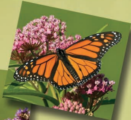
Example of artwork from Chippy Chipmunk: Babies in the Garden